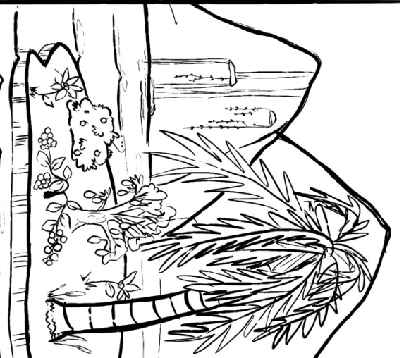
3 LAND & PLANTS