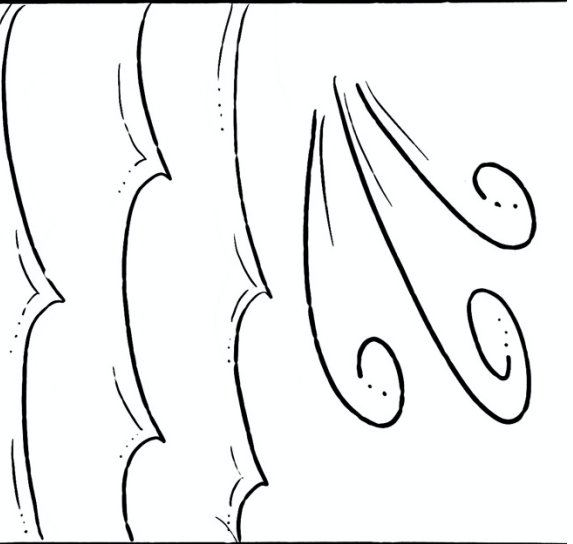
2 SKY & OCEAN