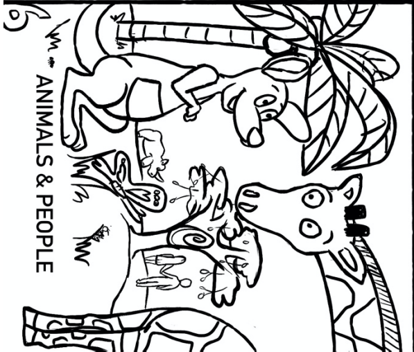
6 ANIMALS & PEOPLE